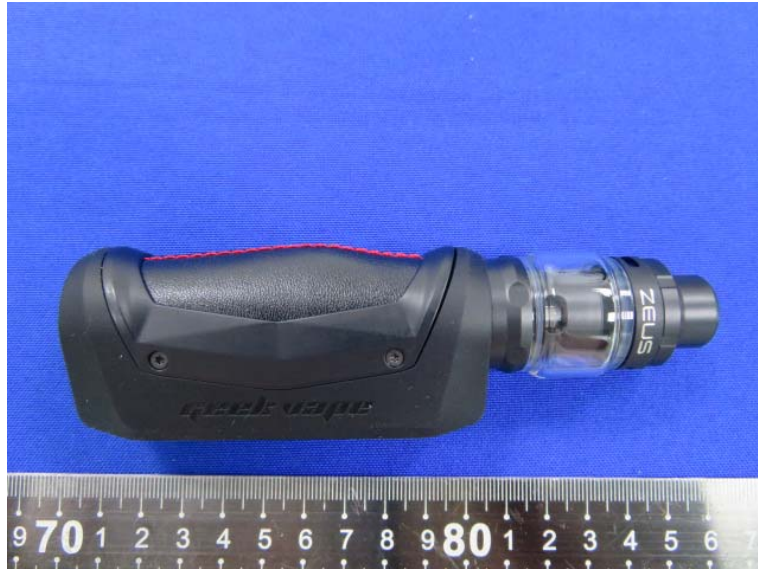
GEEKVAPE AEGIS SOLO ZEUS KIT