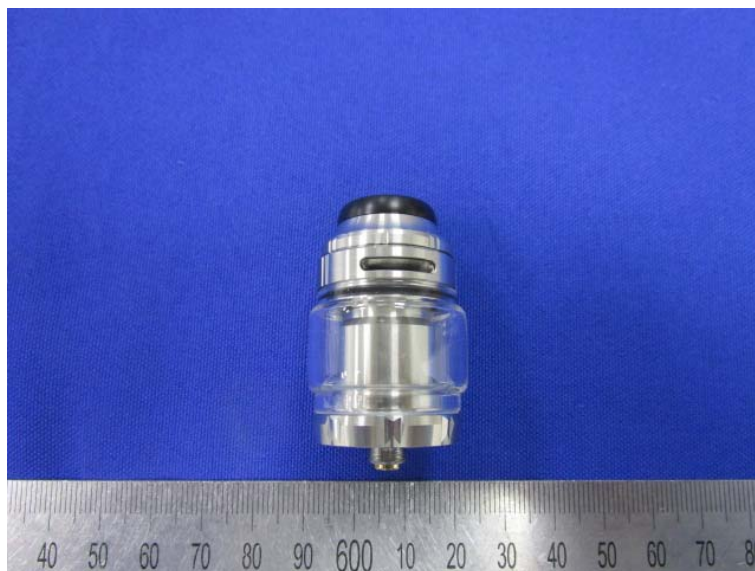
GEEKVAPE ZEUS X RTA